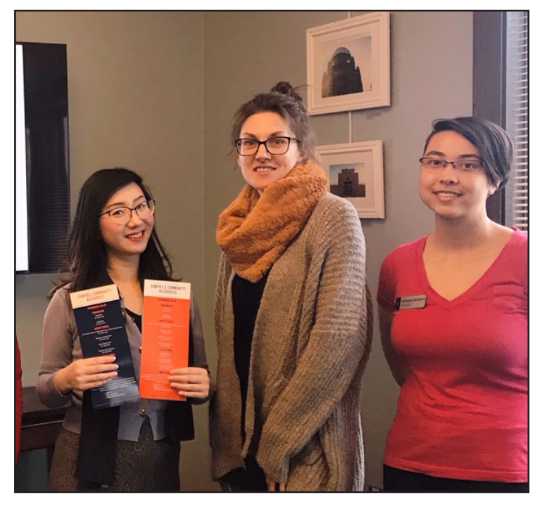
API Roots and Alcohol and Other Drug Outreach Team members collaborate on an outreach at the Asian American Cultural Center.