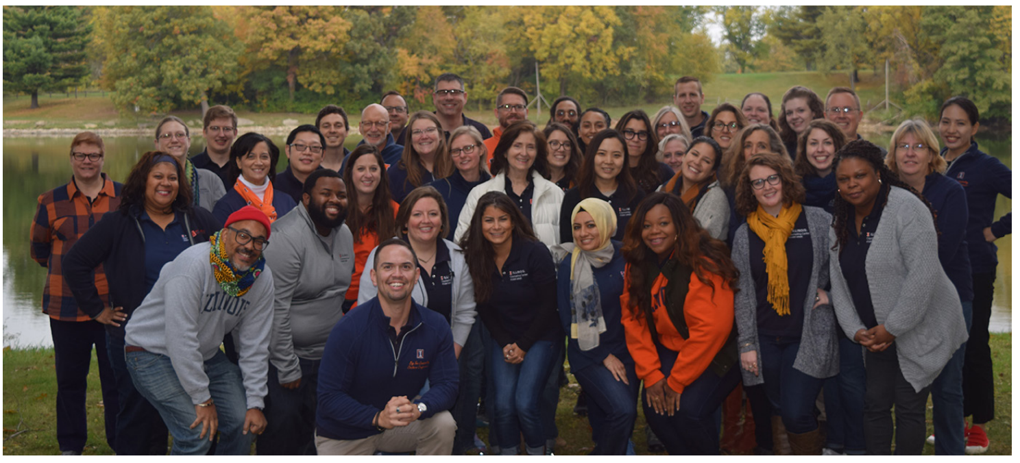
Counseling Center staff members at fall 2019 retreat.