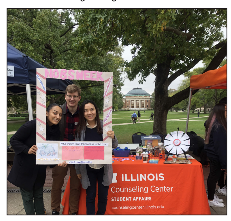
Members of the Eating Disorders Outreach Team get out the message of No Body Shaming on the Quad.