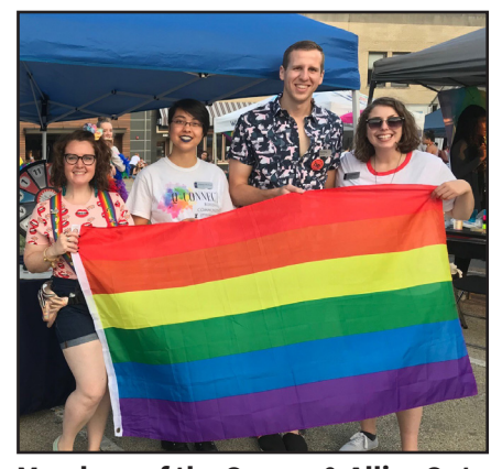
Members of the Queers & Allies Outreach Team at CU Pridefest.